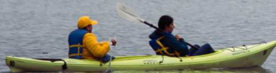
Image: Two people kayaking in Olympic National Park